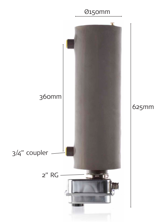
Diagram of boiler with external hot water tank