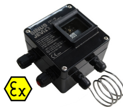
Item no. 90900250

Hazardous area thermostat type ERT-10 is suitable for direct control of ERB - explosion proof finned tube heater. The ERT-10 surface mounted thermostat stands for reliable temperature control, even under extreme conditions. A convenient view window enables you to see the adjustable set point of the thermostat without removing the lid. The (outside) construction and enclosure of the thermostat comply with increased safety (Ex 'e') requirements and enable usage of 'simple' (Ex 'e') cable glands. Two cable glands are available for both incoming and outgoing cable. Maximum 16A / 230 VAC load can be switched by the single pole (double throw) potential free thermostat contact. The adjustable temperature range is -20°C up to +40°C and the admissible ambient temperature is -40°C up to +40°C. The (outside) IP65 enclosure is made of reinforced polyester, making it suitable for placement in harsh environments. Its Ex approvals apply to explosive gas atmospheres (zone 1 and 2) or dust atmospheres (zone 21 and 22).